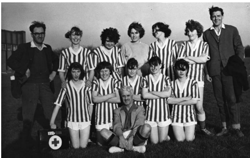
Women's Football Team, Evode, Stafford, about 1960