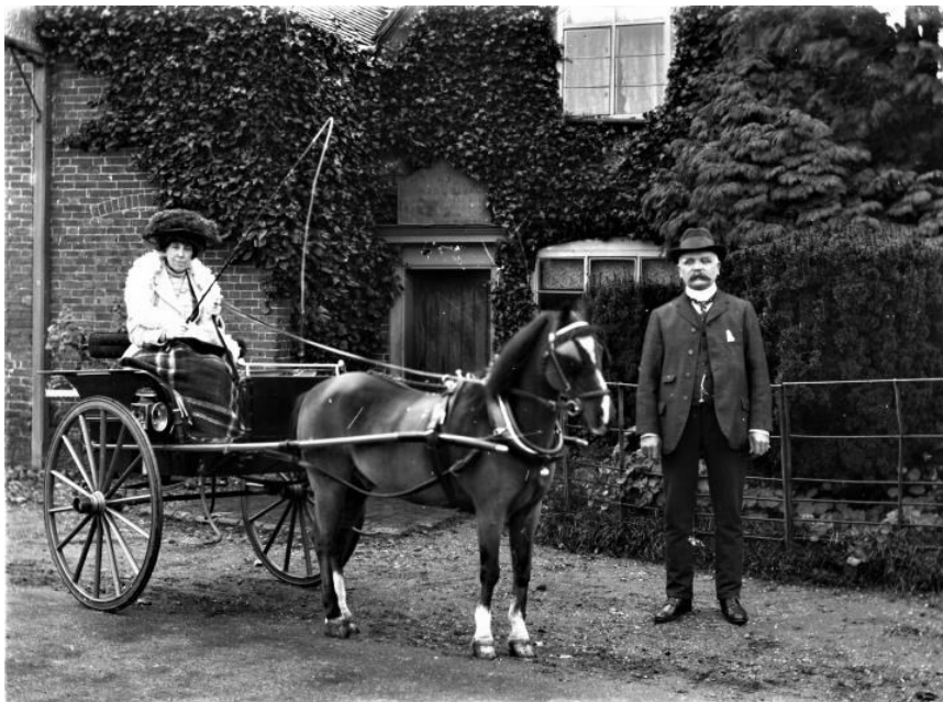
The Red Lion, Sutton, near Forton.