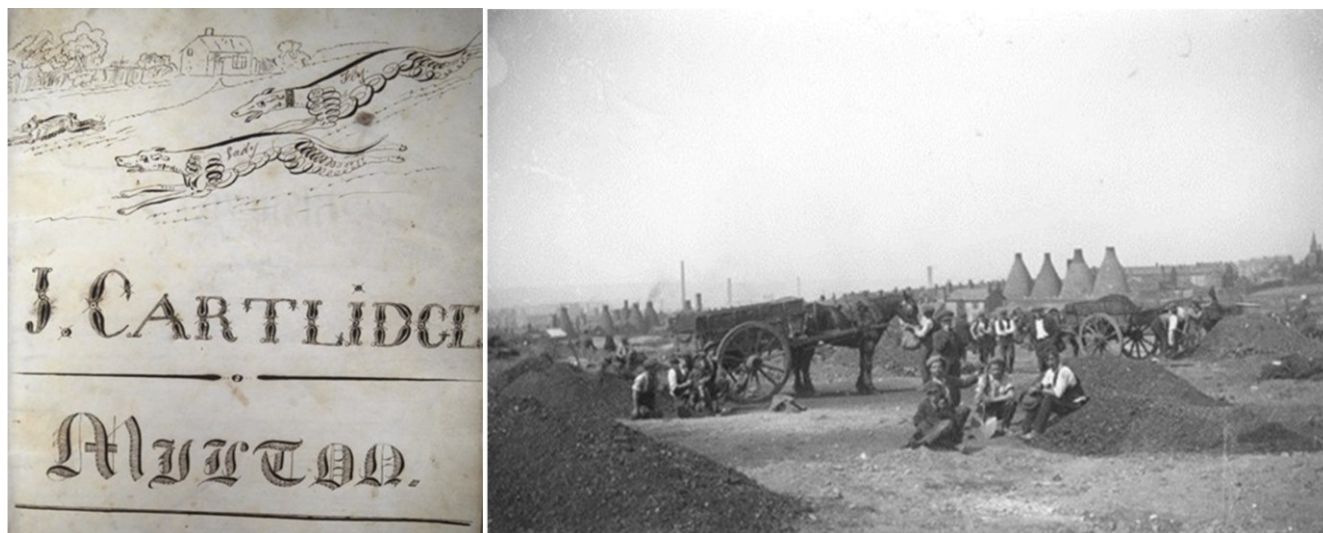
Images shared on social media: illustration from school exercise book and a scene from the General Strike of 1926

We've recently been focusing on how we can use social media to promote our collections at Stoke-on-Trent City Archives. Highlights have included a series of 1920s posts to mark the release of the 1921 census, interesting new accessions received by the archives, and documents viewed by visitors in our reading room.