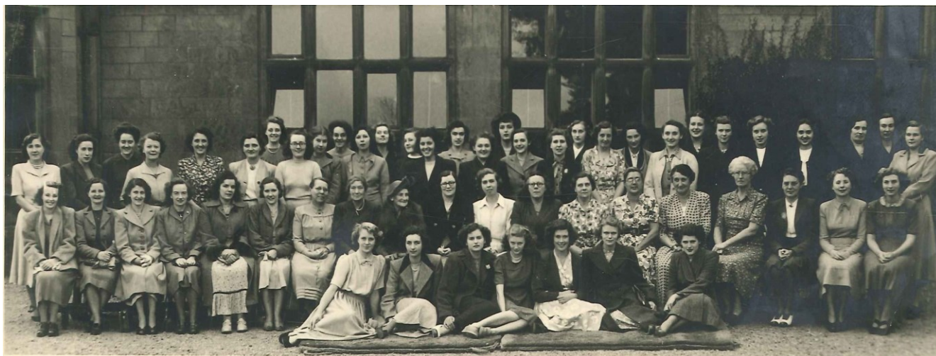
Staff and pupils at Westwood Hall Girls' High School, Leek, c.1940s (7901/1)

The lifting of covid restrictions meant that we received far more accessions than last year, but still lower than in many recent years. Sadly, it has become clear that many organisations had to close for good during the lockdown periods, and this is reflected in our accessions. We continue to look out for under-represented types of collections, aiming to reflect the County and City in all aspects of its life and people.