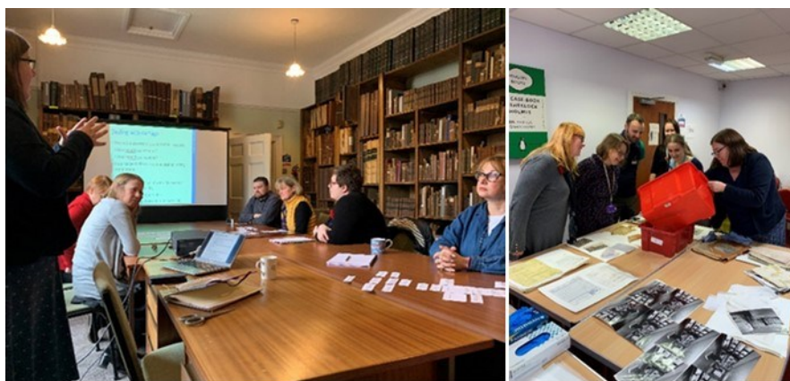
Emergency planning training in Stafford and Stoke, November 2021