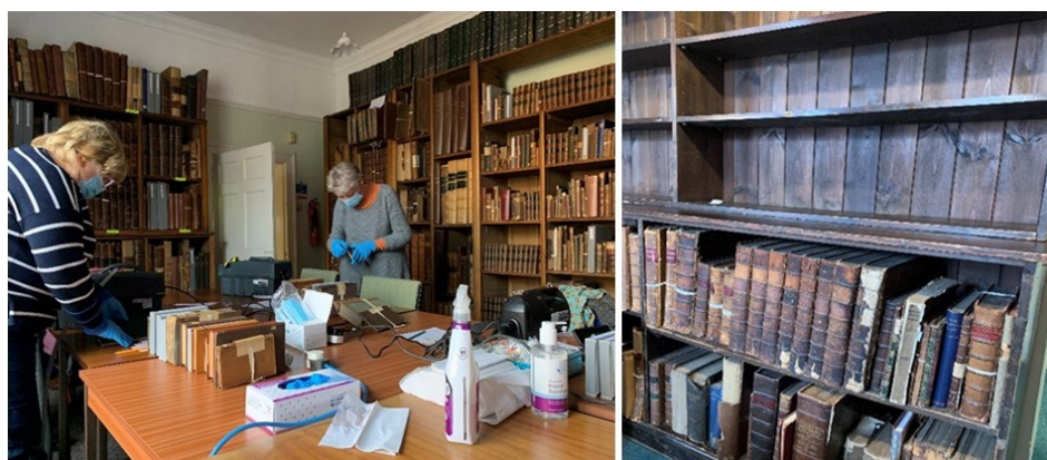
Volunteers cleaning and packaging William Salt Library collections, early 2022