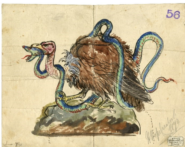
A superb piece of artwork from the Minton Archive featured in the Majolica Mania exhibition (SD 1705/MS1787)

Following multiple pre-pandemic research visits to Stoke-on-Trent City Archives and meticulous planning with the organisers of the exhibition, the City Archives delighted to loan several archival items from the Minton Archive for incorporation in the 'Majolica Mania Exhibition: Transatlantic Pottery in England and the United States, 1850–1915'. This is largest and most comprehensive exhibition yet mounted of a significant nineteenth-century innovation in ceramics. Carefully shipping these precious items out to America (there were also several items loaned from the Potteries Museum and Art Gallery) during the Pandemic was extremely challenging, but it has been wonderful for the City and the Archive Service to be part of such a significant celebration of ceramic history. These items have been on view for the past year at the Bard Graduate Center, New York City and The Walters Art Museum, Baltimore. The City Archives has also received a copy of the publication which accompanies this exhibition.